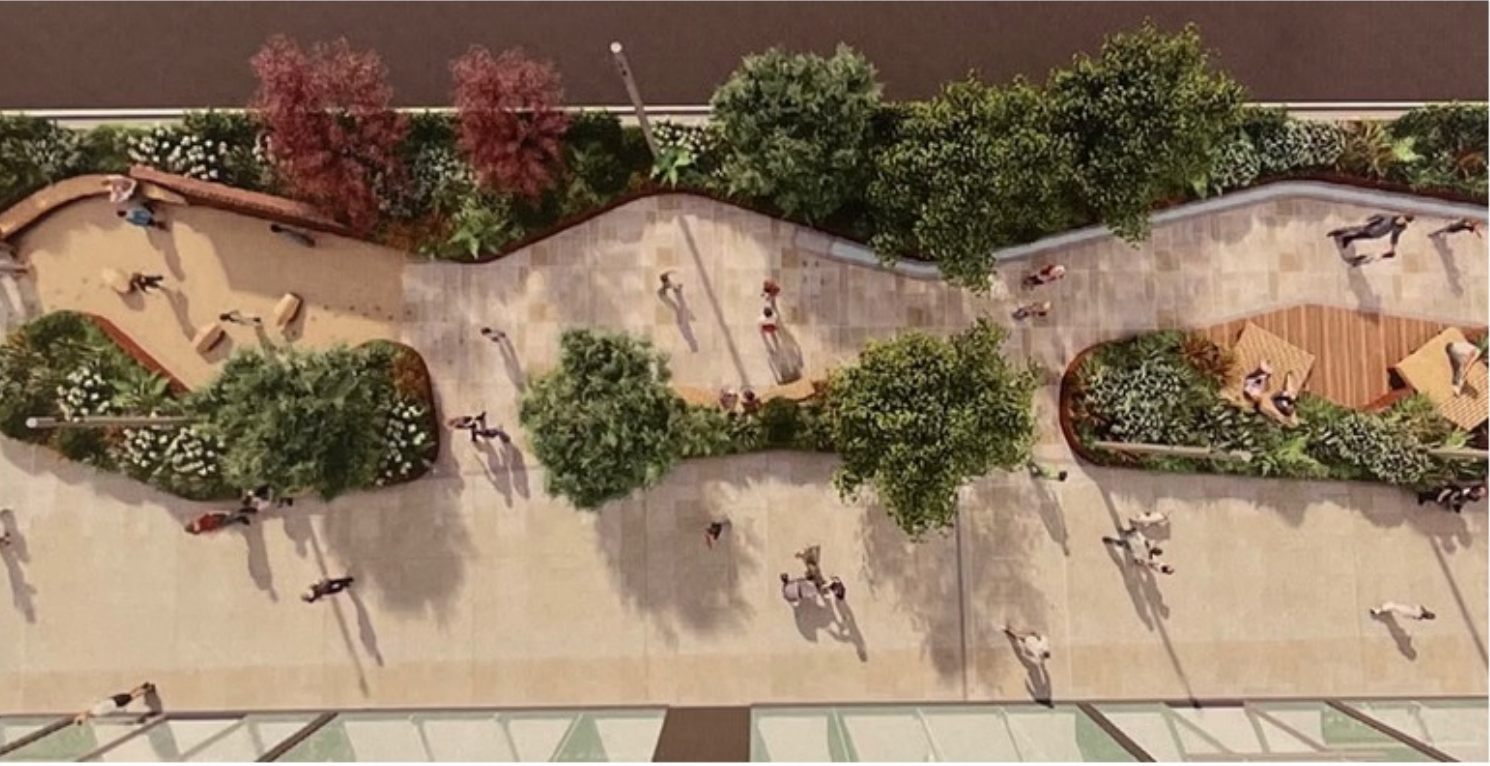
Example of a shaded "stroll" design