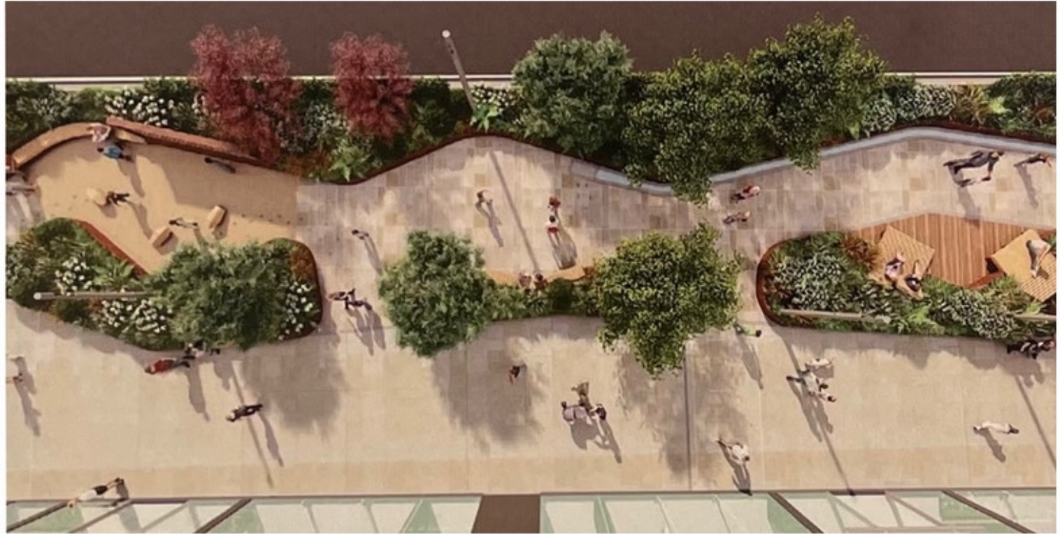
Example of a shaded “stroll” design