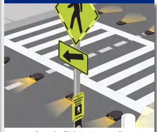
Example of lighting in crosswalk

Mon. - Thurs., Dec. 4 - 7, 2023; 9:00am - 4:00pm