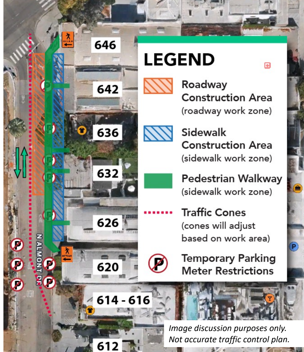
Image discussion purposes only. Not accurate traffic control plan.