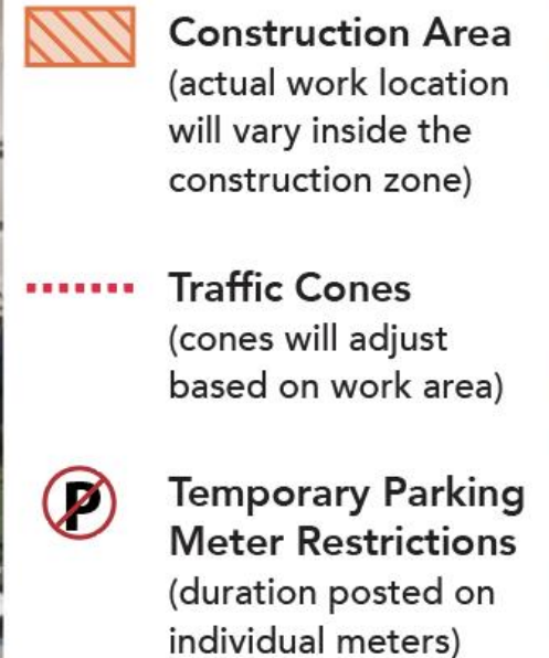
Image for discussion purposes only. Not accurate traffic control plan.