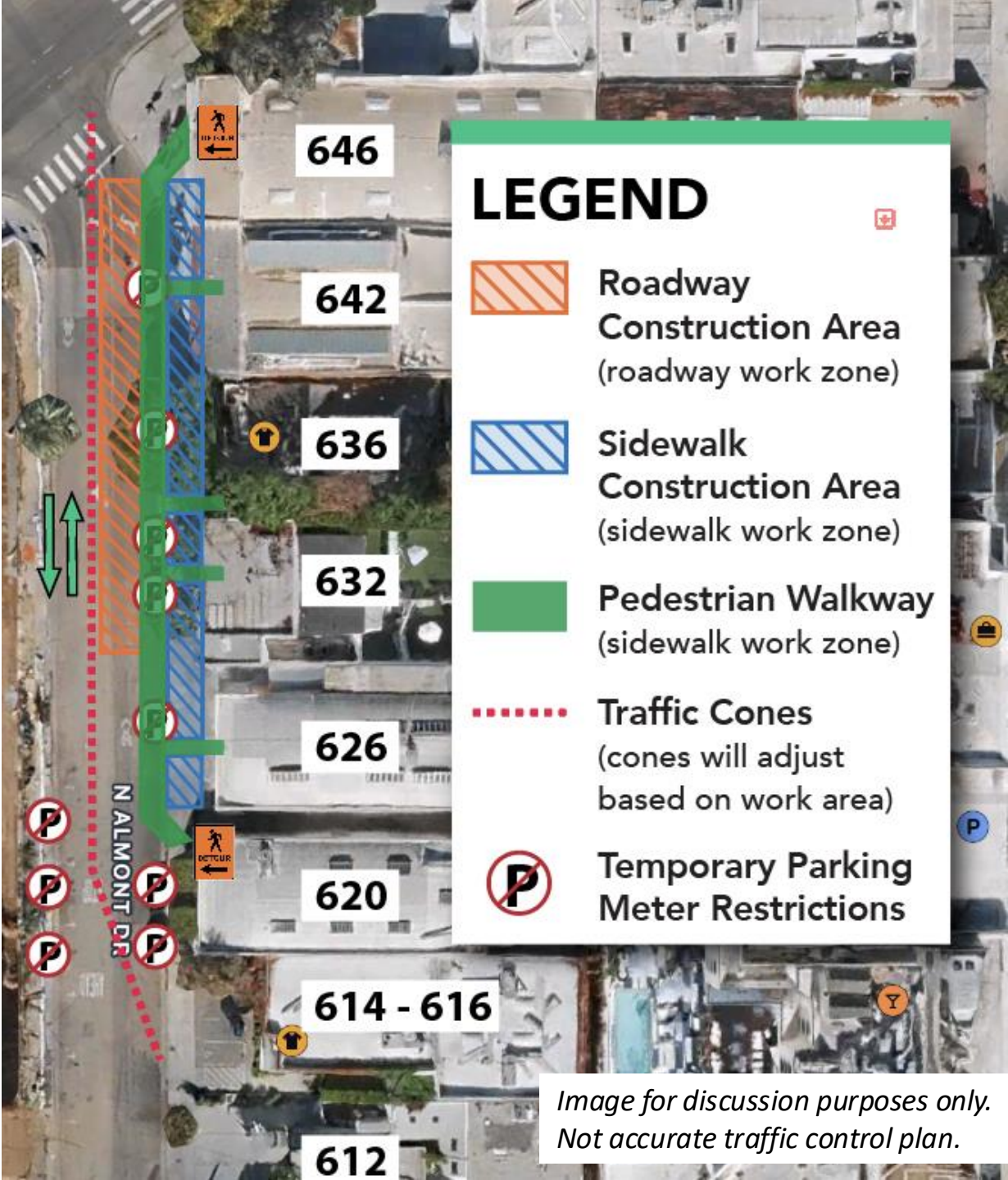
Image for discussion purposes only. Not accurate traffic control plan.