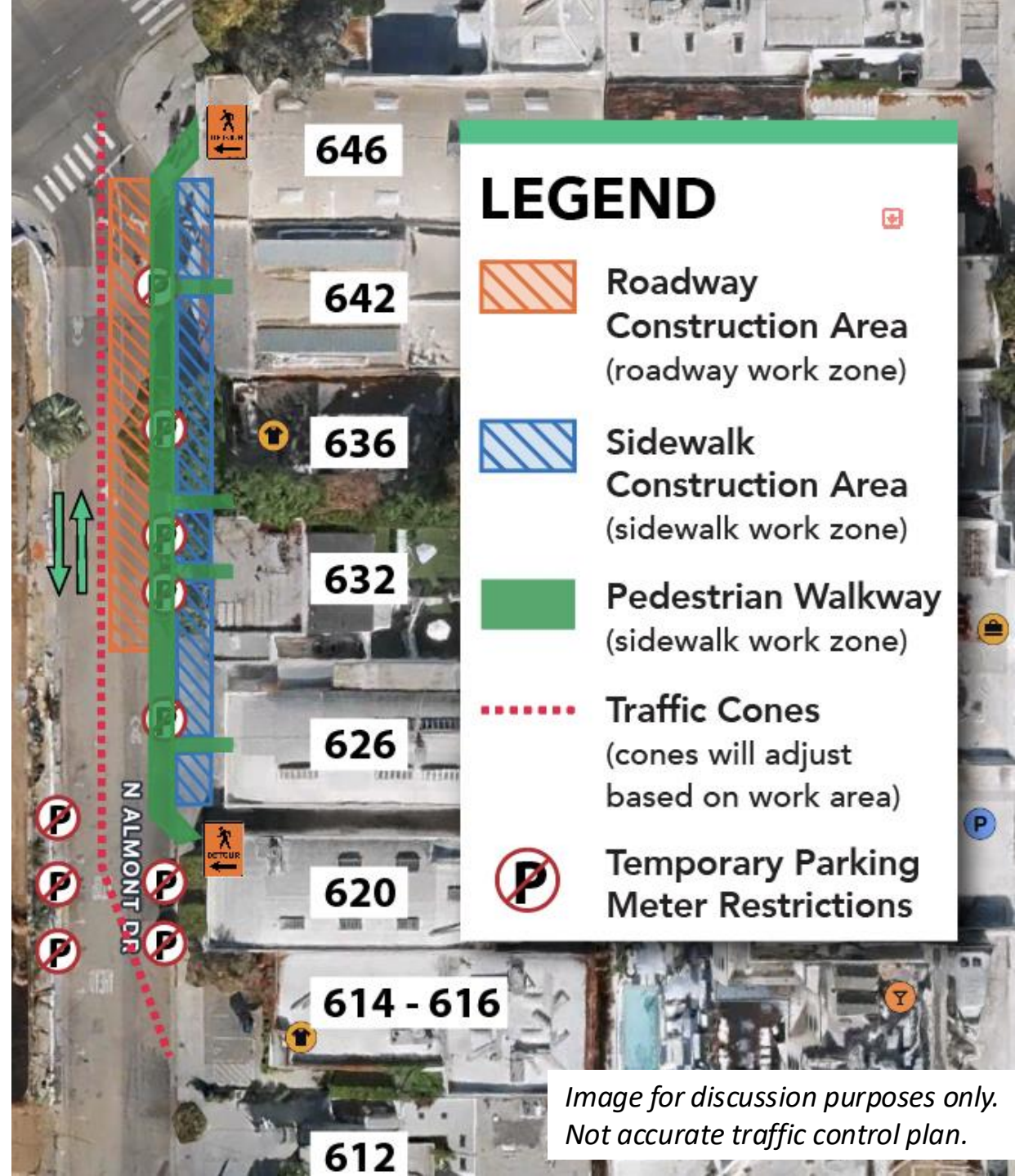
Image for discussion purposes only. Not accurate traffic control plan.

*All date are approximate and subject to change.